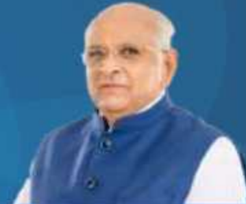
Shri Bhupendrabhai Patel - Chief Minister of Gujarat