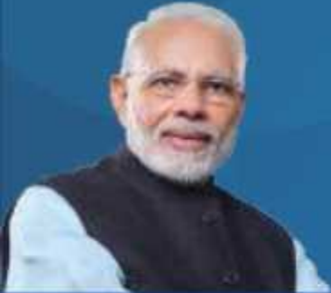
Shri Narendrabhai Modi - Prime Minister of India