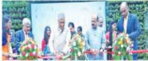
Chief Minister of Karnataka Basavaraj Bommai, and Minister of State for Road Transport & Highways & Civil Aviation, Government of India, General V K Singh, inaugurate CII EXCON yesterday at the Bangalore International Exhibition Centre, Bengaluru.