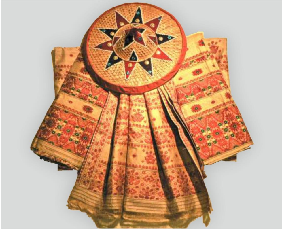
Muga Silk of Assam