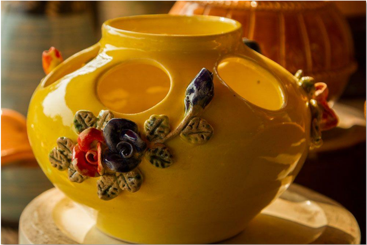
Chunar Glaze Pottery