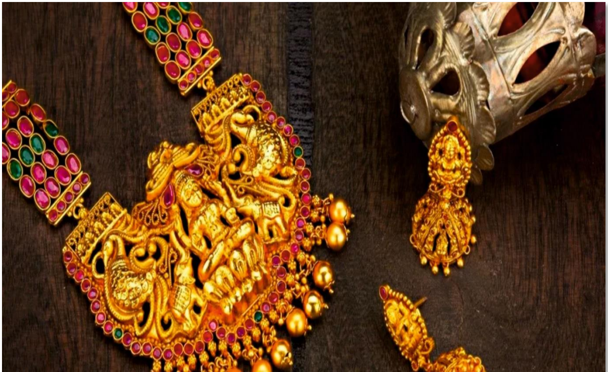
Temple Jewellery of Nagercoil