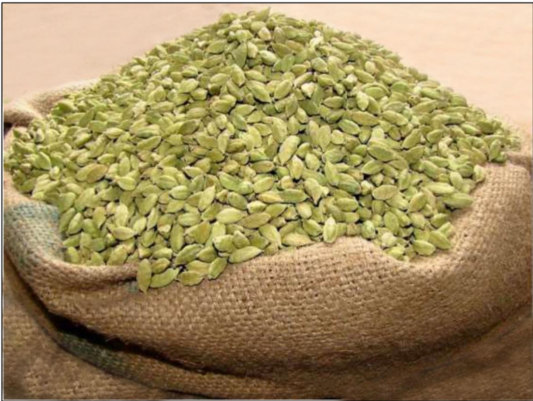
Coorg Green Cardamom