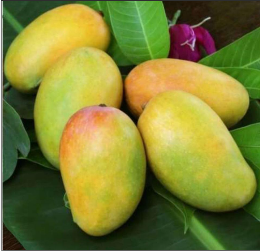
Marathwada Kesar Mango