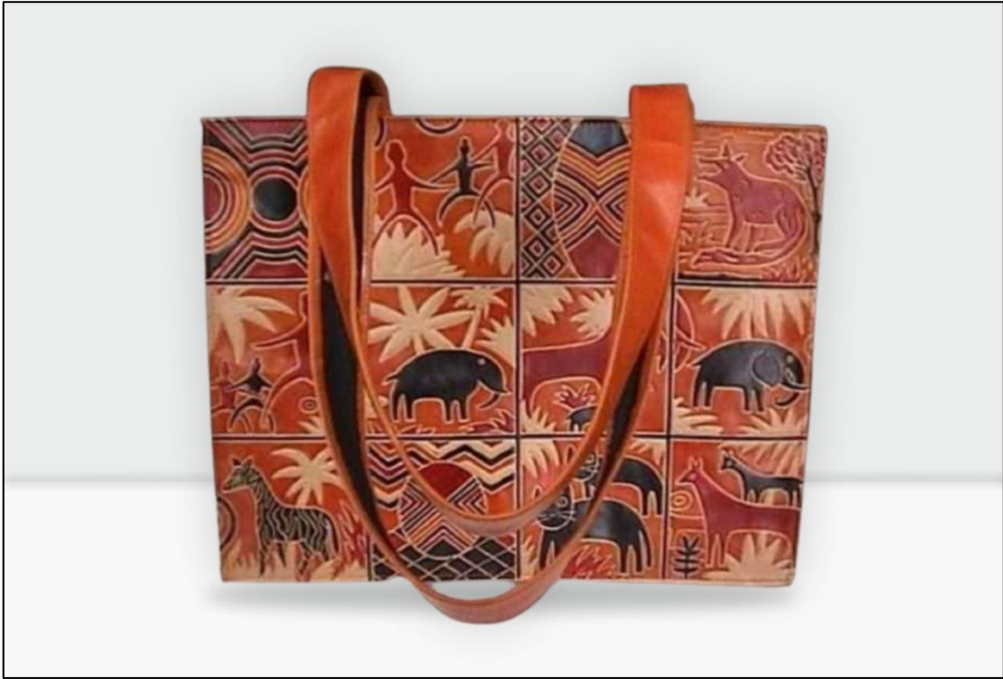
Shantiniketan Leather Goods