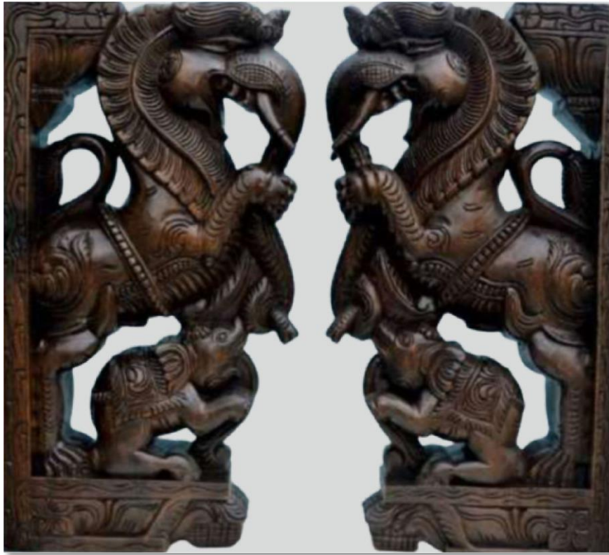
Arumbavur Wood Carvings